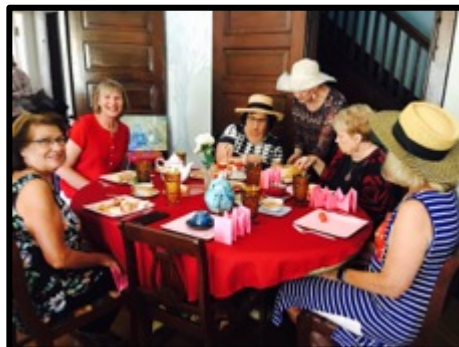
And Tea Party